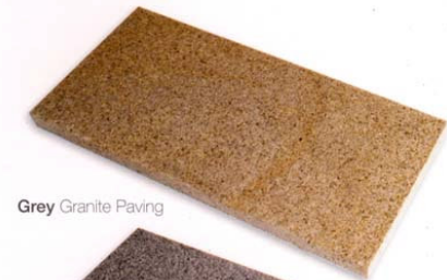
Grey Granite Paving