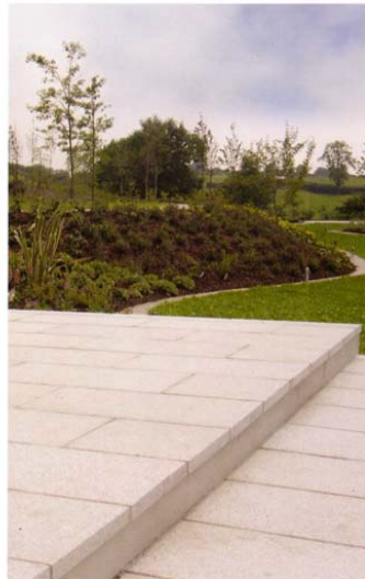
Yellow Granite Paving