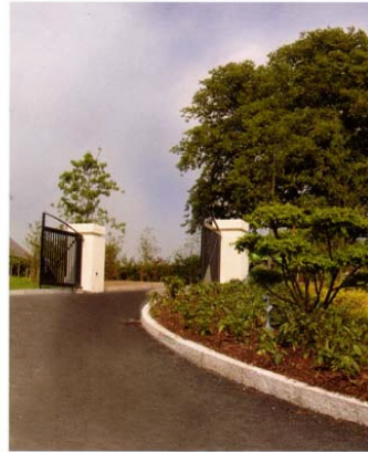
Grey Granite Kerb