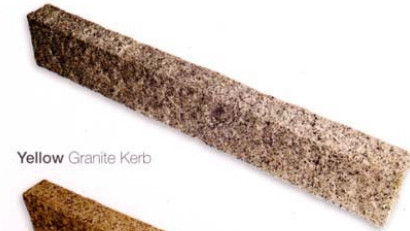
Yellow Granite Kerb